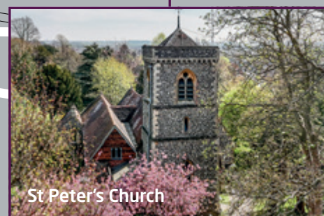
St Peter's Church